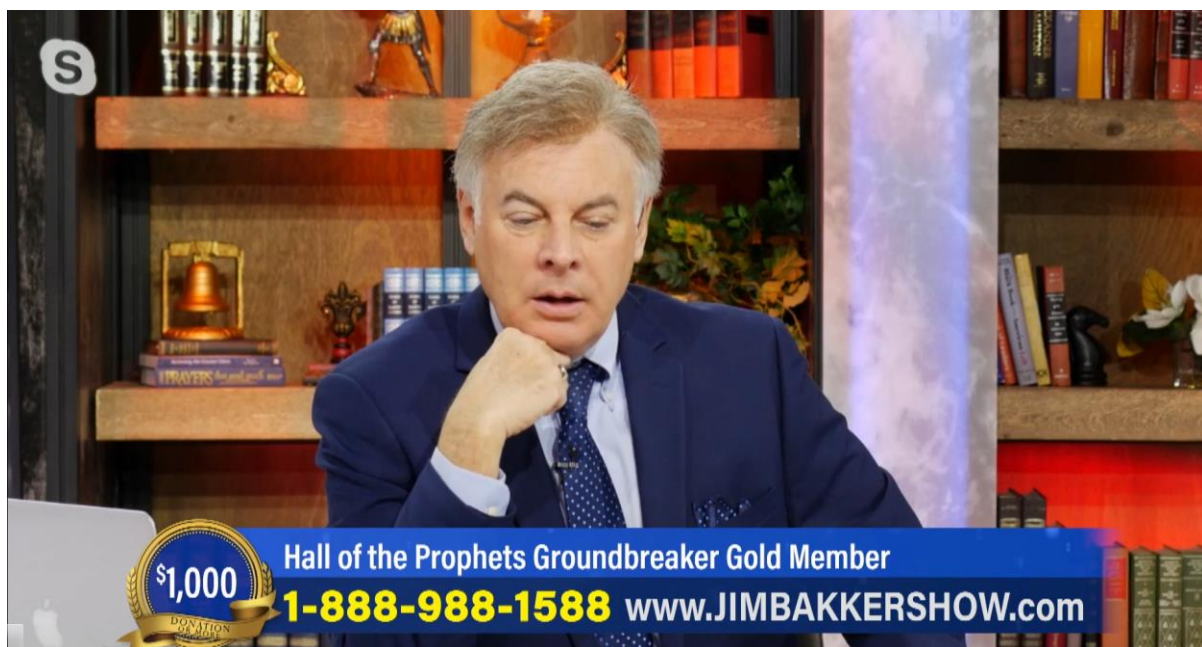
Lance Wallnau on the Jim Bakker show on January 28, 2021

This is the chapter in our story which must tell of the QAnonification of the charismatic church, achieved through the narrative- and event-driven transformation of the identity of the apostolic-prophetic movement.