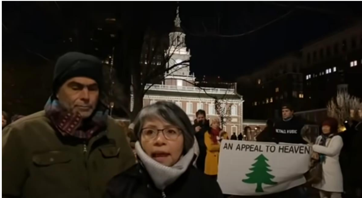
Charismatic-Pentecostal followers of Dutch Sheets gather in Philadelphia at 12:33 AM on December 2, 2020 to declare that "Valkyrie has fallen."

It was time for the ekklesia to take up its scepter and rule.