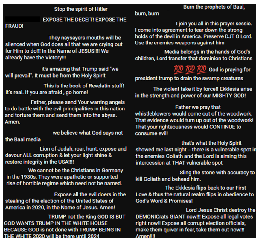
Selected chat contributions from Pray for America from Arizona (November 23, 2020).

I think it is instructive to see the language used by those following these apostolic leaders. All of the memes are here. All of the narratives, the mutations. Remnants, ancient covenants, promises of harvests, Haman's gallows and above all, near-perfect confidence in the reality of claims of electoral fraud. And some other things besides. You can see the full chat in the video streamed on YouTube , or the comments shared on Facebook. Here is a brief selection to give you a sense of just how distributed each of the features of the narrative virus had become by this point. Names have been redacted.